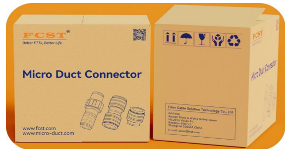
Packing (Packing Bag, Inner Box, Outer Box, label)