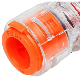
LOGO&Color (Spring Sleeve, Release Sleeve, Locking Clip)