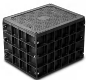
Telecom Manhole Chamber