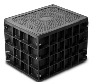
Telecom Manhole Chamber